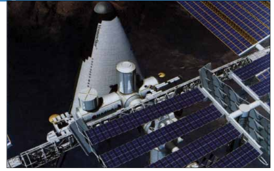
This computer concept shows Lockheed Martin's VentureStar RLV, chosen for NASA's X-33 technology demonstration program, docking with Japan's National Development Agency space station.

In June 1996, Orbital Sciences Corp. (OSC) won a $60 million contract from NASA to design and build a technology demonstration vehicle and operate two flight tests. The flight tests are scheduled in the latter half of 1998. The contract also allows NASA to exercise an option for up to 25 additional test flights. The options are not included in the original $60 million contract. The subscale test vehicle will be taken aloft by an L-1011 aircraft, dropped from the airplane, and then test-flown at speeds up to Mach 8. The test vehicle will have no payload capability. Its goal is to have a recurring flight cost of $500,000. NASA had no plan to build an operational small reusable launcher based on X-34 after the tests, but OSC was contemplating whether to invest its money in a new small RLV. Technology from the program will feed into the decision on whether to build an operational X-33/VentureStar launcher.