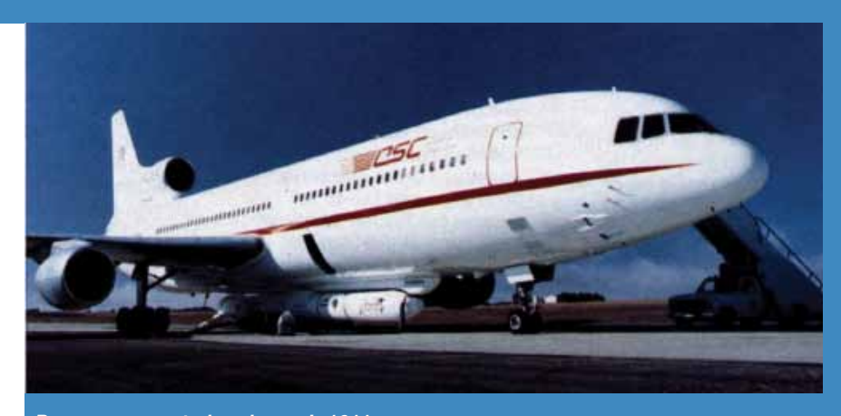
Pegasus, mounted under an L-1011

failure for the payloads. Orbital plans five more launches in 1997 and seven in 1998.