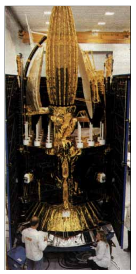
Six TDRSS satellites now on orbit enable NASA to communicate with the space shuttles.

Established in 1964 to own and operate a global constellation of communications satellites. Has 141 members and 24 operational satellites. Intelsat is in the process of restructuring into an intergovernmental treaty organization, which will continue to provide basic global satellite connectivity, and a commercial spin-off